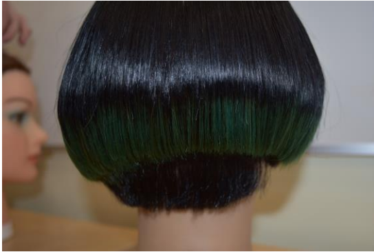
Cutting and Coloring services