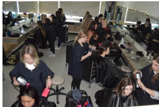
Building Client relationships